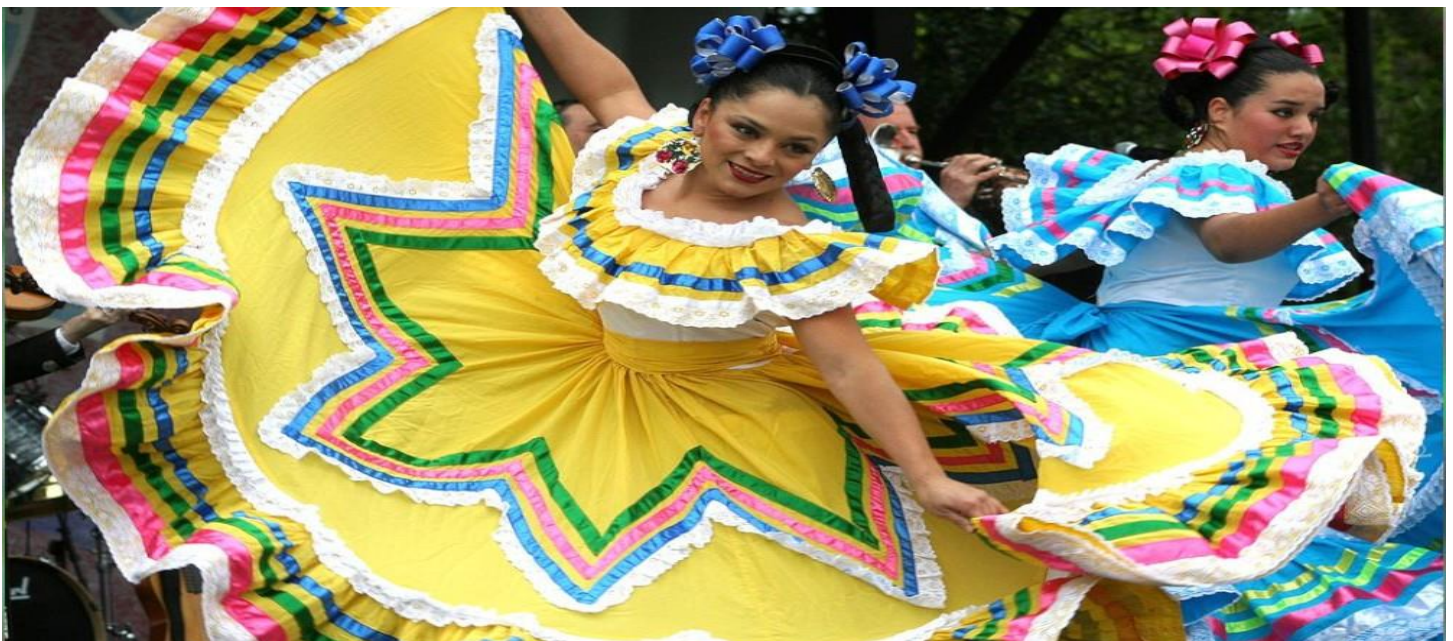
Dancers at the annual Cinco de Mayo Festival in Washington, D.C

Cinco de Mayo celebrates the courage of the Mexican people during this battle. It's often confused with the Mexican Independence Day, which occurred September 16, 1810, about 50 years earlier. The United States celebrates Cinco de Mayo on a much larger scale than Mexico with fiestas, parades, mariachi music, and pinatas.