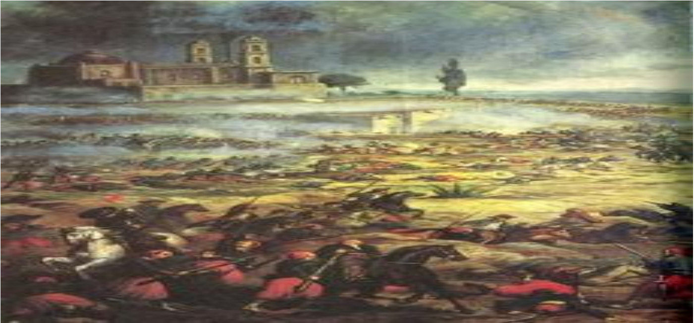
Charge of the Mexican Cavalry at the Battle of Puebla

On May 5, 1862, La Batalla de Puebla was fought. When the battle was over, the untrained Mexican forces (made up of commoners) had won victory over the all-powerful French army. Although this victory did not win the war, it did show the courage and strength of the Mexican troupes.